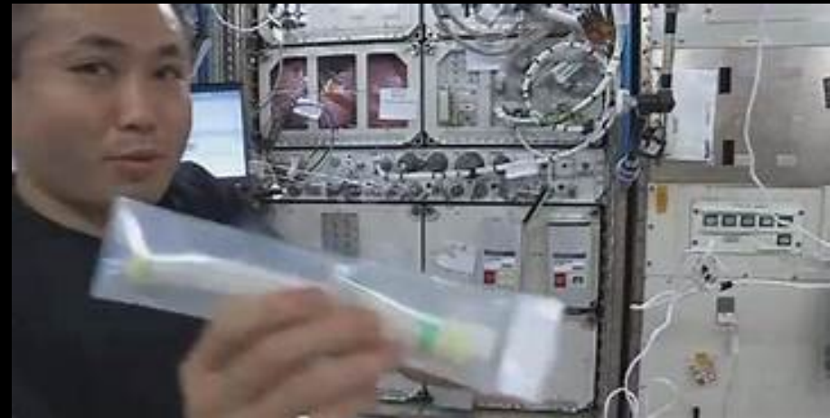
Flight Engineer Koichi Wakata (Japan) shakes to mix a Student Flight Experiment from SSEP Mission 3b/4 to ISS