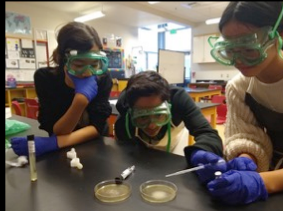
SSEP Student Researchers from Harper Woods, MI (left) and Bellevue, WA (right) designing and testing microgravity experiments for SSEP Mission 14 to ISS