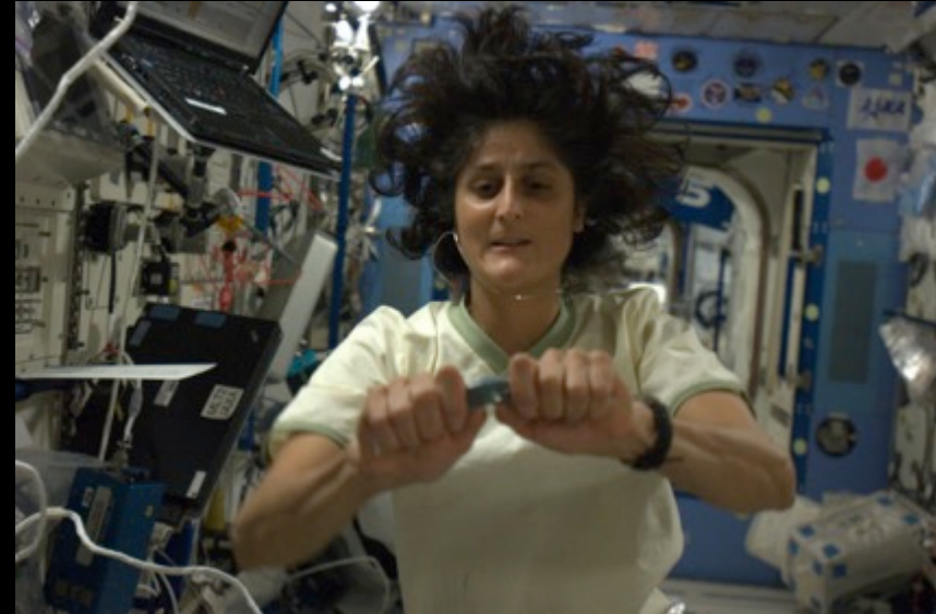
ISS Commander Sunita Williams (USA) activates a student flight experiment from SSEP Mission 2 to ISS